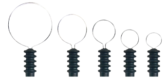
Tungsten Wire Loop Electrodes †