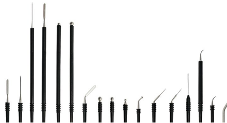
Reusable Electrodes †