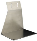
A813 Table Top Stand †