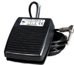
A803 Footswitch †