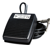
A803 Footswitch †

The Derm 102 has a bipolar mode going up to 10 watts