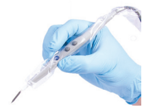
A910ST Sterile Handpiece Sheath †