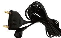
A827V Forcep Cable †