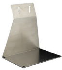
A813 Table Top Stand †