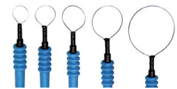
Disposable Dermal Loops †