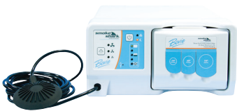
SE02 Smoke Evacuator †