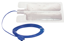
ESREC - Split Disposable Return Electrode with cord †