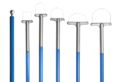
Disposable LLETZ/LEEP Loop and Ball Electrodes †