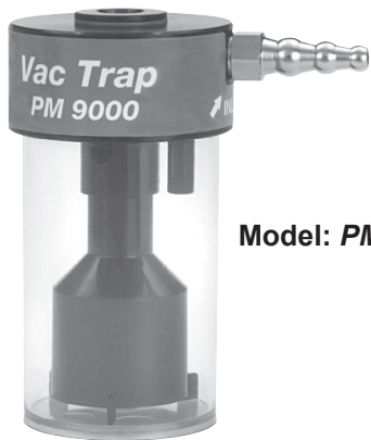
Model: PM9000 (shown)