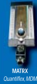
MATRIX Quantiflex, MDM

Flowmeters should be calibrated and have maintenance service every 2 years. There are literally thousands of flowmeters in dental operatories that have not been checked in over a decade. Many of the manufacturers of many of these units are now out of business. Porter Instrument Company offers fast turn-around service on the following flowmeters: Porter Standard Serial No. 14000-25000; Porter MXR Serial No. 50000-80000.