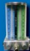
HAMPTON Simplaire Mica