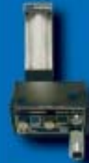
MDT-McKesson Analor Four