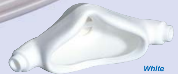
White Citrus Disposable*