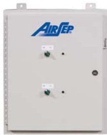
Air Compressor Module

The Centrox is an oxygen generator ideal for use in many applications. The Centrox's ability to deliver up to 95% oxygen concentration at flows of up to 32 SCFH (0.84 Nm 3 /hr or 15 LPM) make it a great fit for commercial uses requiring up to 50 psig (345 kPa or 3.5 barg).