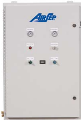
PSA Generator Module