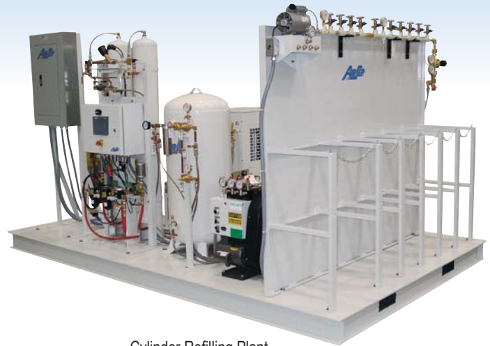
Cylinder Refilling Plant

These cylinder refilling plants operate automatically and generate oxygen that meets the United States and European Pharmacopoeia Oxygen 93 Percent (93% ±3%) Monograph. For special applications, an optional high purity module can be added to the plant, to increase oxygen concentration to 99% ±0.5%.