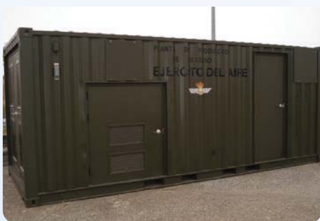
AS-J250-HPCR Containerized High Purity Packaged PSA Oxygen Plant for the Spanish Military — Spain