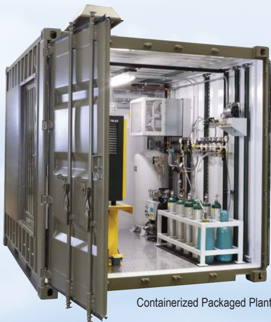
Containerized Packaged Plant

Note: The 220 V ~ ±10%, 50 Hz configurations for AS-D+ - AS-L are available for medical applications for export only outside of the USA.