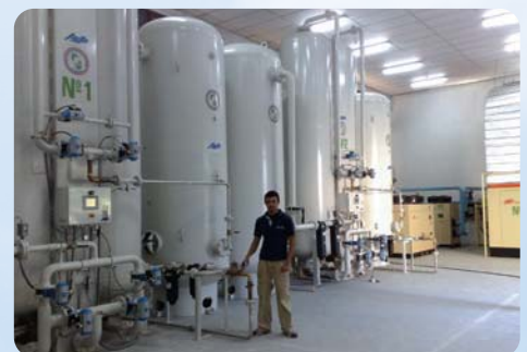
AS-Z5500-HM Duplex PSA Medical Oxygen Plant — Paraguay