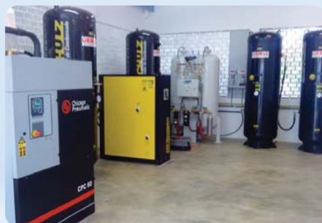
AS-K750-HM PSA Medical Oxygen Plant — Brazil