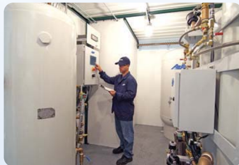
AS-J250-HPCR Containerized High Purity Packaged PSA Oxygen Plant for NATO Forces — Afghanistan