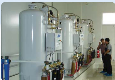
AS-K900-HM Triplex PSA Medical Oxygen Plant — China