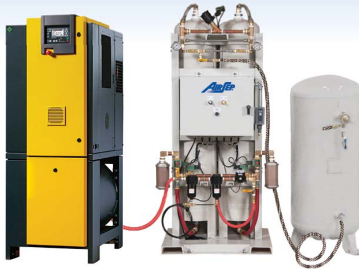
Air Compressor with Refrigerated Dryer and Air Receiver