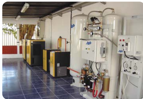
AS-G300-HM PSA Medical Oxygen Plant — Uruguay