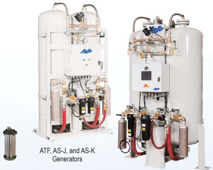
ATF, AS-J, and AS-K Generators

Fully automatic, the generators require no specialized operating personnel. Simply connect an air compressor or central air supply to the generator and your application or oxygen distribution system to the generator's oxygen receiver. Then connect the power cord to a grounded electrical outlet, turn the unit on, and set your oxygen delivery pressure. That's all there is to it. A simple on-off switch supplies oxygen whenever you need it.