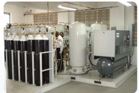
AS-J450-HMFM Duplex PSA Medical Oxygen Plant — Kenya