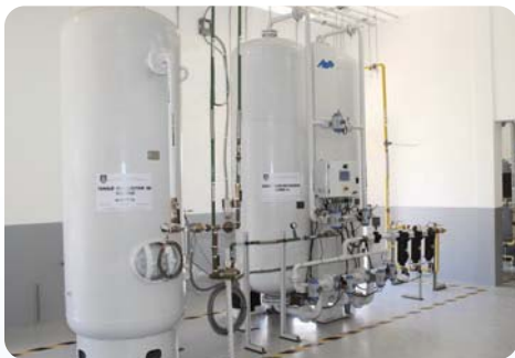
AS-Q2600-HM Duplex PSA Medical Oxygen Plant — Nicaragua

AirSep Medical Oxygen systems can be fabricated in accordance with all relevant local codes (e.g., ASME, ANSI, NEMA, CSA, CRN, CE/PED, TSG R0004-2009, HTM2022, ISO 9001, ISO 13485, ISO 10083, and USPXXII Medical Oxygen Standards).