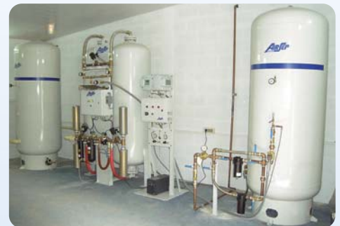
AS-L1000-HM PSA Medical Oxygen Plant — Uruguay