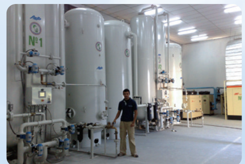
AS-Z5500-HM Duplex PSA Medical Oxygen Plant — Paraguay