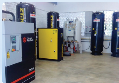
AS-K750-HM PSA Medical Oxygen Plant — Brazil