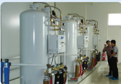
AS-K900-HM Triplex PSA Medical Oxygen Plant — China