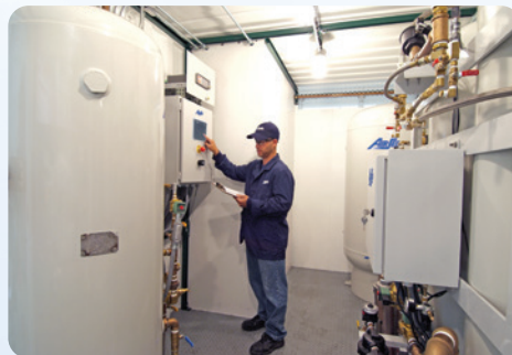
AS-J250-HPCR Containerized High Purity Packaged PSA Oxygen Plant for NATO Forces — Afghanistan