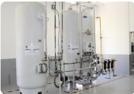
AS-Q2600-HM Duplex PSA Medical Oxygen Plant — Nicaragua

AirSep Medical Oxygen systems can be fabricated in accordance with all relevant local codes (e.g., ASME, ANSI, NEMA, CSA, CRN, CE/PED, TSG R0004-2009, HTM2022, ISO 9001, ISO 13485, ISO 10083, and USPXXII Medical Oxygen Standards).