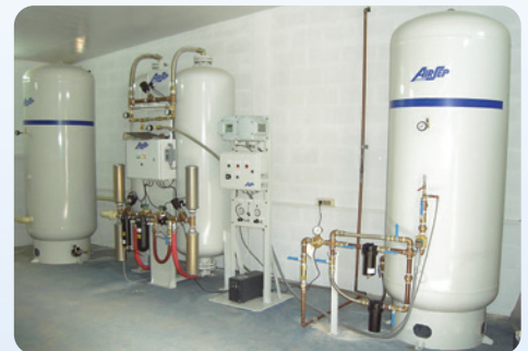
AS-L1000-HM PSA Medical Oxygen Plant — Uruguay