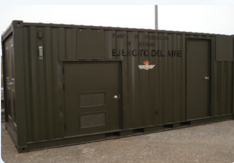
AS-J250-HPCR Containerized High Purity Packaged PSA Oxygen Plant for the Spanish Military — Spain