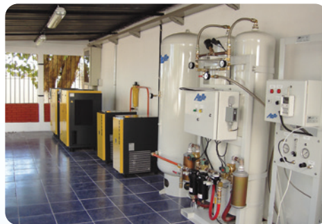
AS-G300-HM PSA Medical Oxygen Plant — Uruguay