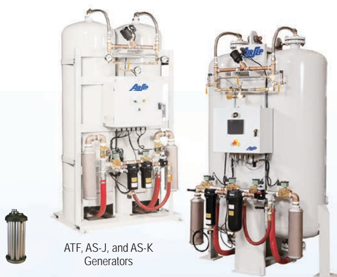
ATF, AS-J, and AS-K Generators

Fully automatic, the generators require no specialized operating personnel. Simply connect an air compressor or central air supply to the generator and your application or oxygen distribution system to the generator's oxygen receiver. Then connect the power cord to a grounded electrical outlet, turn the unit on, and set your oxygen delivery pressure. That's all there is to it. A simple on-off switch supplies oxygen whenever you need it.