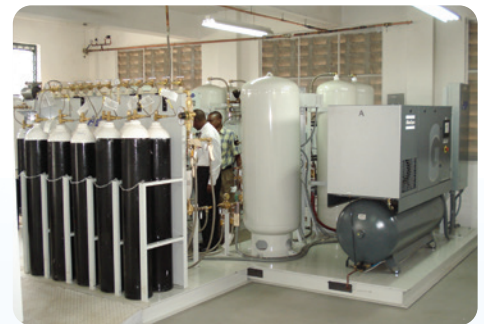
AS-J450-HMFM Duplex PSA Medical Oxygen Plant — Kenya