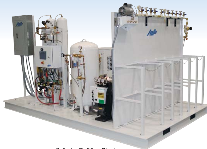
Cylinder Refilling Plant

These cylinder refilling plants operate automatically and generate oxygen that meets the United States and European Pharmacopoeia Oxygen 93 Percent (93% \pm 3%) Monograph. For special applications, an optional high purity module can be added to the plant, to increase oxygen concentration to 99% \pm 0.5%.