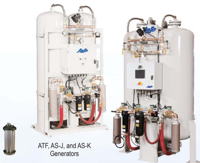
ATF, AS-J, and AS-K Generators

Fully automatic, the generators require no specialized operating personnel. Simply connect an air compressor or central air supply to the generator and your application or oxygen distribution system to the generator's oxygen receiver. Then connect the power cord to a grounded electrical outlet, turn the unit on, and set your oxygen delivery pressure. That's all there is to it. A simple on-off switch supplies oxygen whenever you need it.