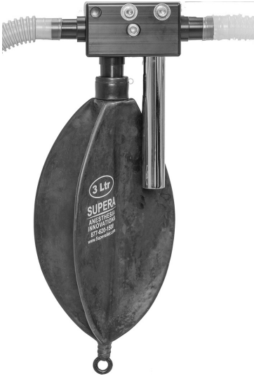
Optional waste gas interface valve P/N EVC630 for use with fan based evacuation systems like our EVC3000