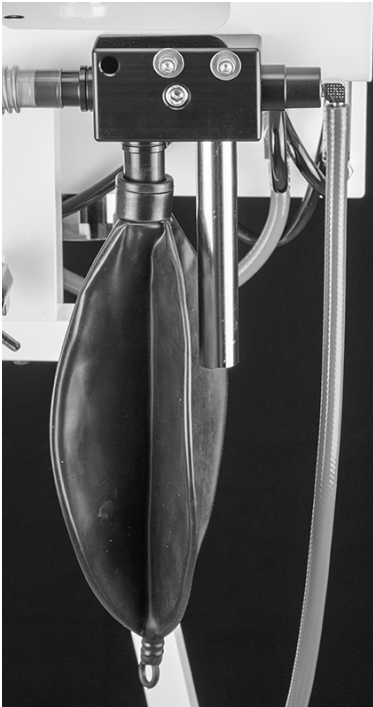
Optional waste gas interface valve P/N EVC629 for use with vacuum pump based evacuation systems like our EVC3100